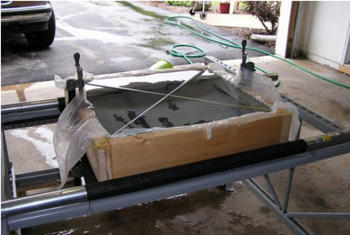
Figure 5: Test Frame with Loaded Fabric.

For this Phase water will be used to load the fabric as shown in Figure 5. After each test is completed the panels will be unloaded and the fabric allowed to return to its original state. The reason for this is to determine whether the fabric can produce results that are consistent and repeatable. This will aid in determining whether the fabric may be reused .