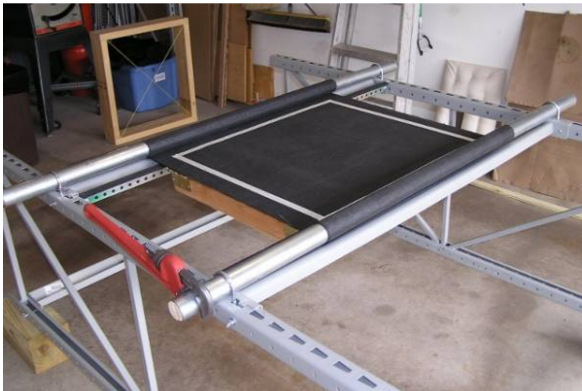
Figure 3: Test Frame with Fabric.