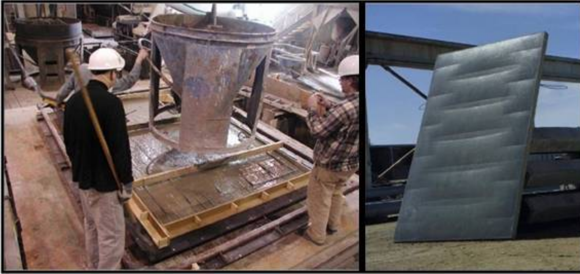
Fig. 1. Full-scale formwork and completed concrete panel.

This novel way of forming concrete has been experimented with by individuals and institutions internationally in recent years but little engineering analysis and system verification or validation through experimentation has been conducted. Due to the complex shapes that can be achieved with fabric forms their analysis is beyond the computational formulae currently used to calculate simple prismatically shaped member capacities. Prior to the P.I.'s initial research into this unique method of forming concrete no design procedures or methods to predict the deflected shape of a fabric cast concrete member had been developed. And, from an engineering point of view the challenge was to find a method to analyze the complex structural shape a fabric cast concrete wall panel could ultimately take. If a flexible formwork system is to be of practical use a method to analyze the forming system and the members produced by it must be put into place.