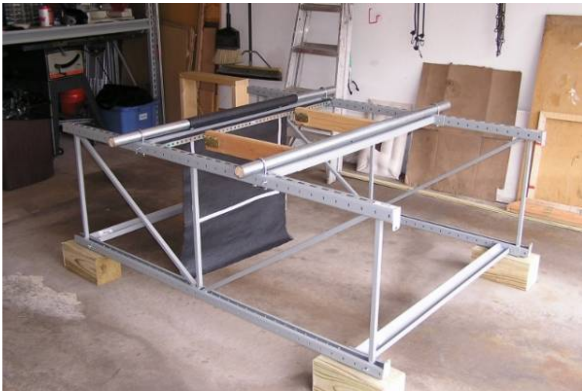
Figure 2: Test Frame.

Tests will be conducted on simple “pillow” shaped panels with the fabric formwork placed into two states, one taut and one prestressed. Deflection of the fabric will be monitored using deflection gages (deflectometers). Relaxation of the geotextile fabric formwork under the prestressed state, prior to loading, will be monitored using a photogrammetric technique. Photogrammetry can be used to obtain qualitative information on the geometry, displacement, and strain of a physical model in a noninvasive way. This technique is preferred over the use of bonded strain gages for analyzing strain since it eliminates the undue influence bonded strain gages have on the testing results. Since bonded strain gages are generally stronger than the material they are attached to they can adversely affect testing results. The technique is an inexpensive, high-resolution, noninvasive and efficient method that uses standard commercial software ( PhotoModeler 6 [5]) and a digital camera. This technique will also be used to monitor fabric strain under load. See Figures 2 thru 5 for the proposed test frame setup.