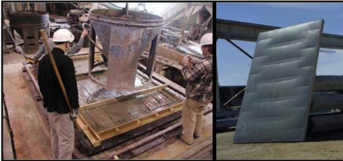
Fig. 1. Full-scale formwork and completed concrete panel.

This novel way of forming concrete has been experimented with by individuals and institutions internationally in recent years but little engineering analysis and system verification or validation through experimentation has been conducted. Due to the complex shapes that can be achieved with fabric forms their analysis is beyond the computational formulae currently used to calculate simple prismatically shaped member capacities. Prior to the P.I.'s initial research into this unique method of forming concrete no design procedures or methods to predict the deflected shape of a fabric cast concrete member had been developed. And, from an engineering point of view the challenge was to find a method to analyze the complex structural shape a fabric cast concrete wall panel could ultimately take. If a flexible formwork system is to be of practical use a method to analyze the forming system and the members produced by it must be put into place.