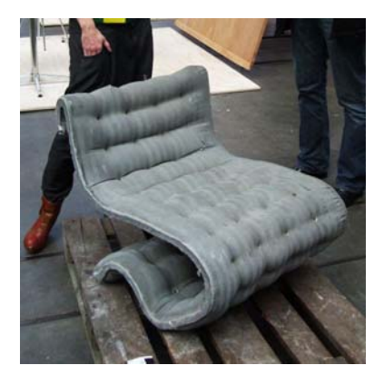
Figure 3: Chair cast in fabric formed concrete