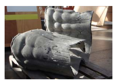
Figure 6: Chair cast in fabric formed concrete. The formwork blew while casting.

Figure 5: Detail of concrete surface showing pattern and fibres from the used upholstery fabric and exposed clamps holes.