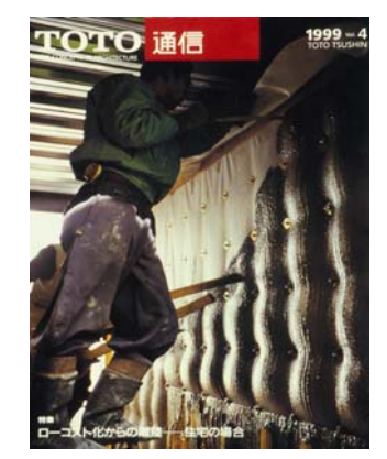
Figure 1: Fabric formed wall by Kenzo Unno