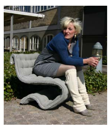
Figure 2: The author seated in a fabric formed concrete chair