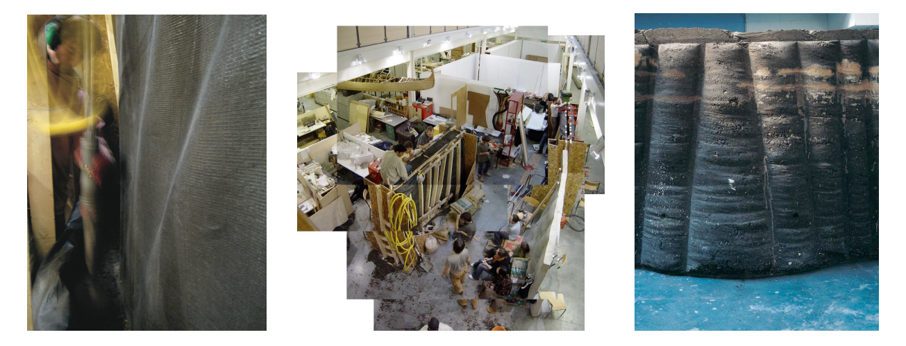
Figure 2: Fabric applied to rammed earth walls UEL 2005, images: A.Spencer, M. Viegas, D. Lellau

exerted by pnumatic ramming. Timber grounds were vertically located and an offset in the plab by 200mm established a slight curve for self stability. The fabric fully absorbed the ramming impact and performed without fault. Accessibility between the vertical grounds was restricted although the unrolling of the fabric as the ramming progressed upwards was succesful. This formwork was still based on the consideration of the fabric as a shutter for concrete. Further development of an earth specific fabric language was necessary, particulrly as the bracing of the formwork was substantial and offered only 40% weight saving over a conventional ply shutter.