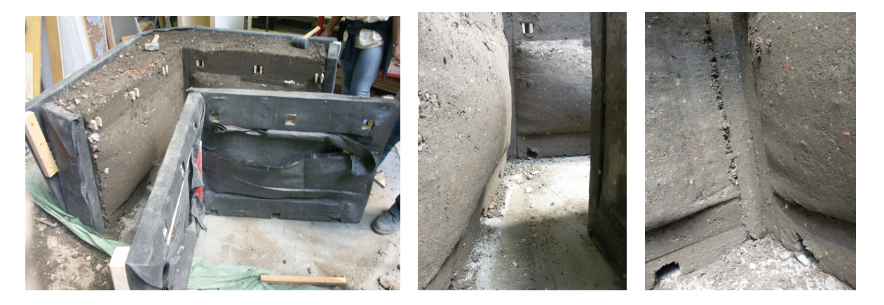
Figure 4: Climbing formwork strike and resulting earth detail

The timber selection proved insufficient – hardwood rather than softwood is required to cope with the pressure even of a hand rammer, which was used for this test rather than pnumatics. However, the result and frepeatability of the system was proven, with fine detail and strong compaction, a total of two lifts were completed establishing the validity of the self supporting concept. The framing of the panels was still additional load on the system weight. Further materials reduction was requie for the system to be completely portable.