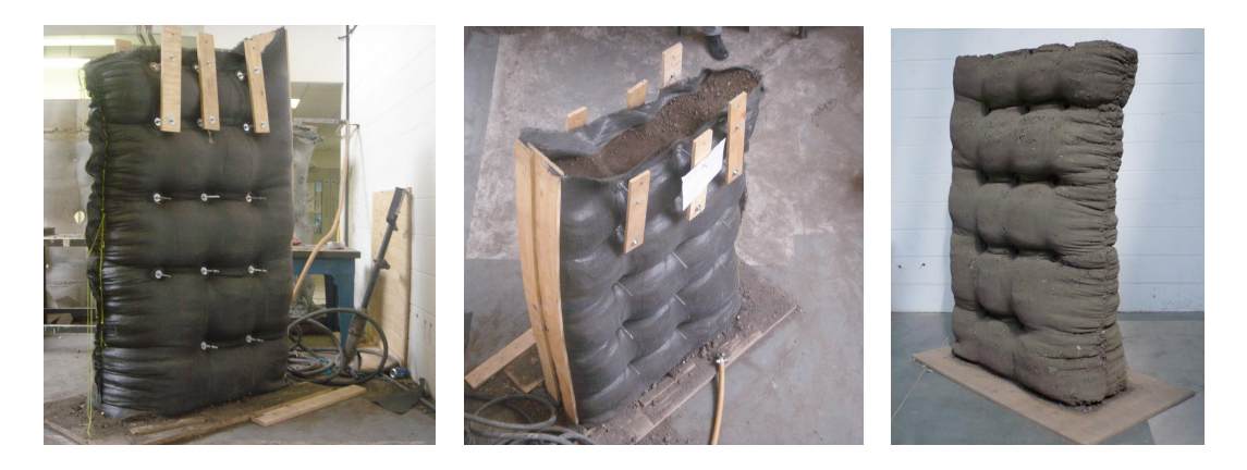
Figure 6: Earth wall system using fabric, bolts and guides 2008

In reflecting upon the ability to 'grow' the formwork during the ramming process, the bolt through technique developed at UEL for a concrete form was used – with timber struts 'borrowing' support offeted by the bolts of the lift below to set out and restrain the bolts above the ramming level. Once the ramming level has passed two bolt levels, the lowest line of bolts may be removed and added to the next layer, further minimising the kit of parts. A simple stitching detail to one end allowed the fabric containment to advance upwards as the earth was rammed. Important innovations in the type of bolt restraint allowed the formwork to be easily removed. In total, excluding the rammer the formwork weighted just over 4 kg for a two metre square panel 350 mm thick.