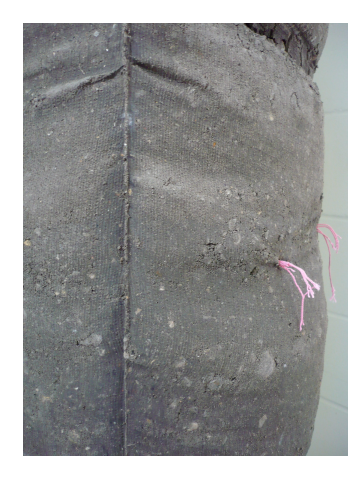
Figure 5: Detail of earth column with restraint thread visible 2007

The use of fabric for concrete columns was developed by Mark West at the University of Manitoba, Canada, refined to fit within a rucksack. However when cast, bracing was required to hold the form during the pour. With the incremental nature of ramming earth – where the layer 150mm below the top surface at any given time is fully compacted, the fabric column form had the ability to 'grow' without bracing. Three column forms were developed and tested, the most successful used simple timber slats as vertical clamps to incrementally rise up the column just in advance of the ramming surface.