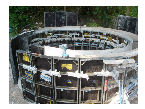
Figure 1: Concrete formwork for rammed chalk - Calyx visitor centre, Dover 2007 by Rowland Keable

Ironically, the advantages of fabric over conventinal rigid concrete shuttering also applies to the construction of rammed earth walls and columns. Conventional rammed earth formwork is fundamentally a re-use of standard concrete forms. With up to 80 kNm2 capacity, these steel framing systems or bespoke timber/ply panel constructions are designed to resist the hydrostatic pressures of liquid concrete, to maintain water tight rigid containment to allow the accurate placement of steel reinforcement and withstand poker vibration. None of these attributes are relevant to earth construction. The dimensions of the system panels are varied, and can carry on average 300 uses per panel. The high quality and cost of these panels is also reflected in the weight, with steel sections generally requiring crane assistance for placement. With timber bespoke panels the variety and size is almost limitless, and wheras the material elements are cheaper on initial outlay, and lighter in weight than the metal systems, the labour time and associated leakage risk on a bespoke system is greater.